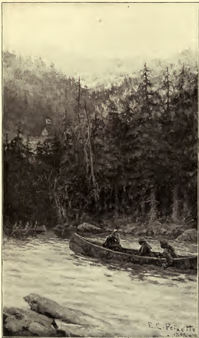
"The canoe rocked in the swirls."